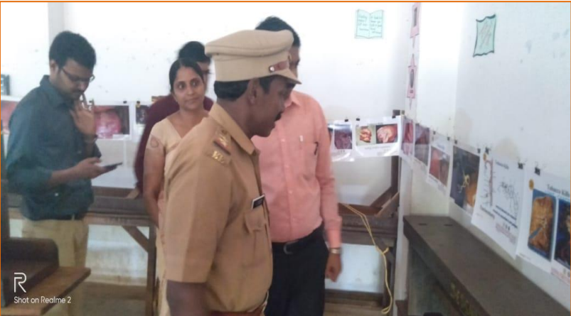
On the day of exhibition